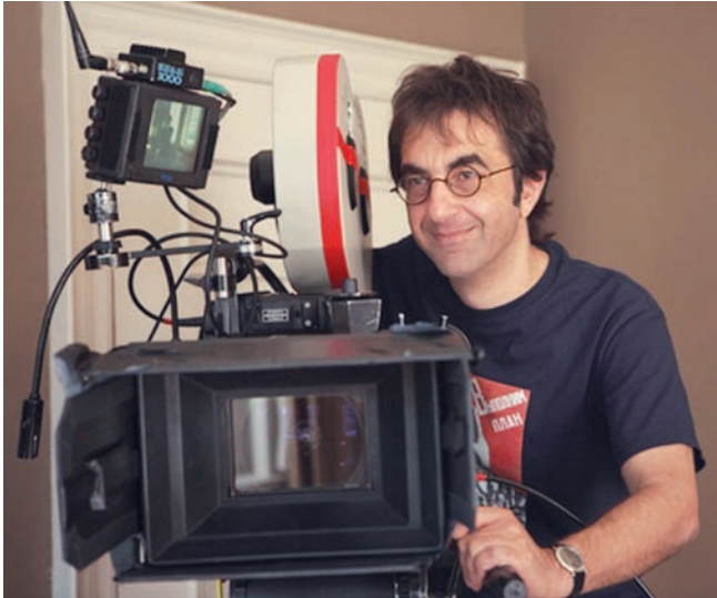
Atom Egoyan, director of the prize-winning film Adoration (2008).

Simon creates a story encouraged by Sabine his teacher that slowly takes on a life of its own.