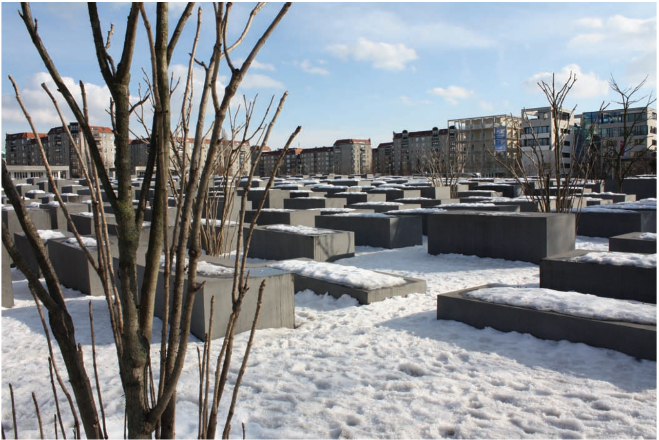
The Memorial to the Murdered Jews in Europe lies in the heart of Berlin, Germany, close to the Brandenburg Gate. It comprises 2,711 concrete stelae laid out in a 'garden of remembrance'. Designed by Peter Eisenman it was completed in 2005.