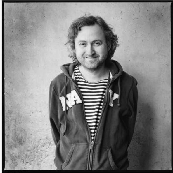
Jan Hrebejk, director of Kawasaki's Rose .

children and the reconstruction of a roundabout destroyed by the bombs. Hope and growth blend with the sorrow of lost family members and land cultivated for generations. Life is persistent, like a dandelion growing through cracks in the asphalt.'