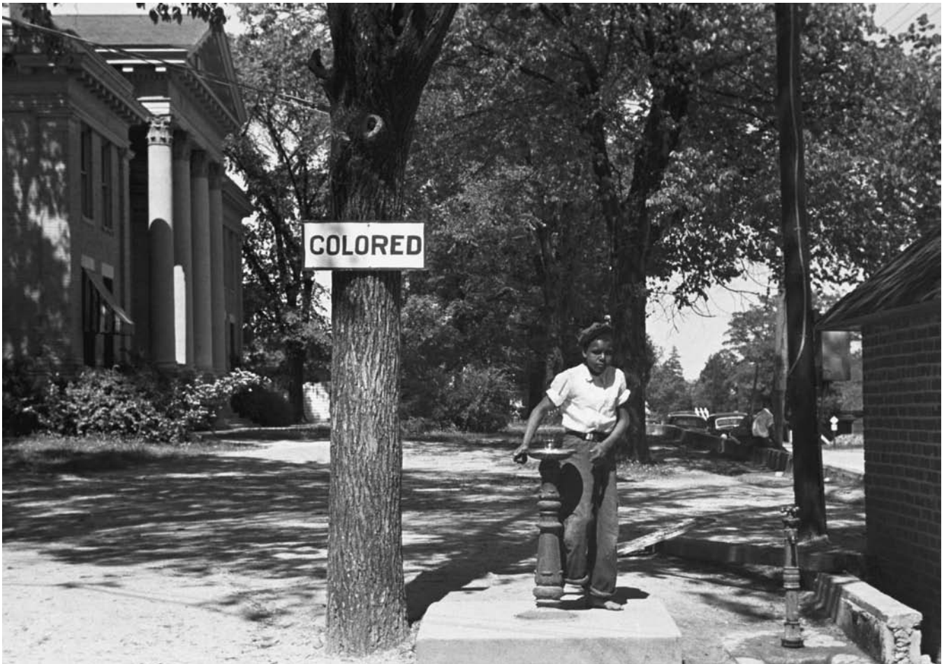
Drinking fountain at the Halifax County Courthouse (North Carolina) in April 1938. The first Halifax county courthouse was built in 1759. In 1847, the first courthouse was replaced by a second, which itself was replaced in 1910 by a third courthouse erected on the site of the second courthouse. The 1938 photo of the drinking fountain on the county courthouse lawn photo is of the 1910 courthouse.