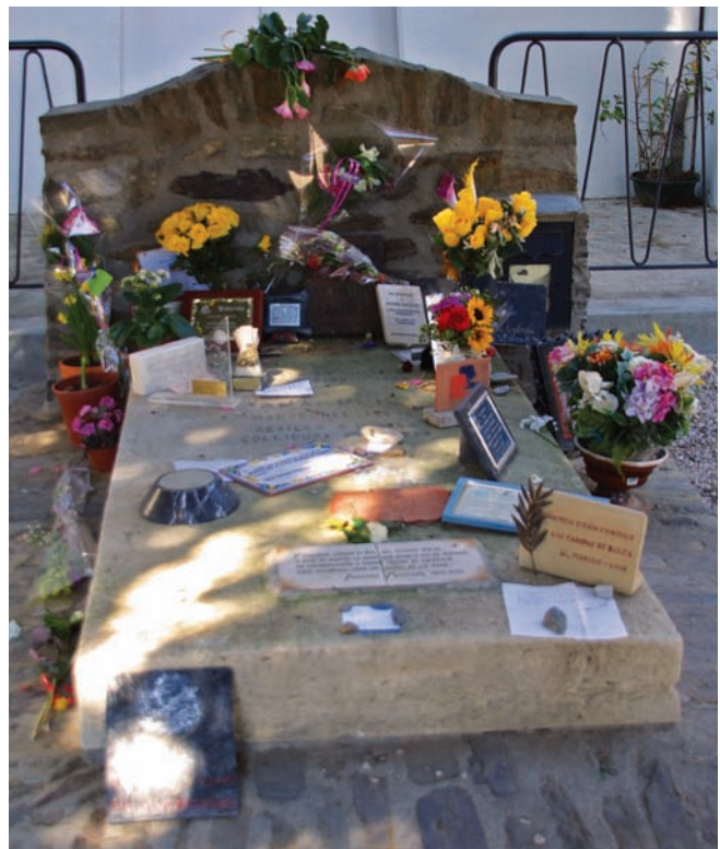
Antonio Machado's tomb in Collioure, a place of pilgrimage for Spaniards. Machado was born in 1875 and died 1939. His later poems are a virtual anthropology of Spain's common people, describing their collective psychology, social mores, and historical destiny. His metaphors use geographical and topographical allusions that frame powerful judgments about socio-economic and moral conditions.

For over two decades, Baltasar Garzón has been courting both approval and outrage. Appointed a National Court judge in 1988 at just 34 years old, he became a national celebrity after tackling the country's cocaine-trafficking webs. Pictured boarding patrol ships and helicopters, the image of Garzón with his thick hair slicked up over a broad, powerful face,