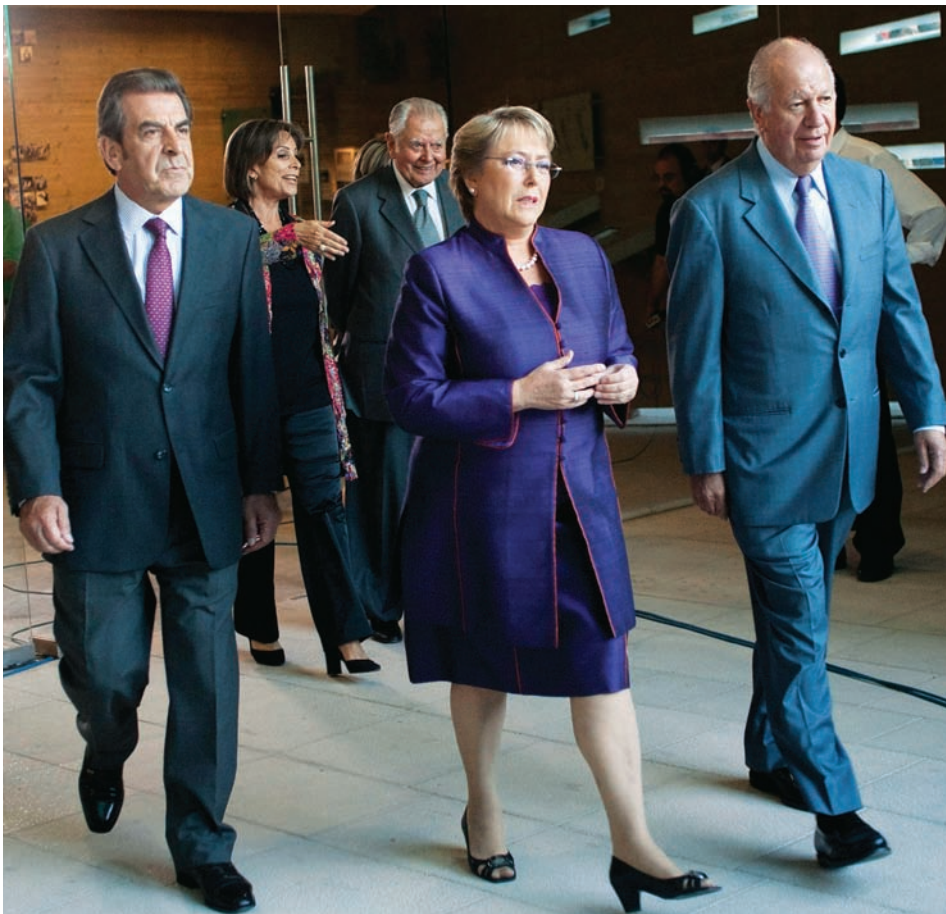
Foto tomada el día de la inauguración con los cuatro presidentes de la Concertación: Michelle Bachelet, Ricardo Lagos, Eduardo Frei y Patricio Aylwin.

En sus aulas se difunden conocimientos destinados a informar y estimular en los visitantes y, especialmente en los jóvenes, la reflexión sobre la importancia de la paz, las consecuencias de la intolerancia y la