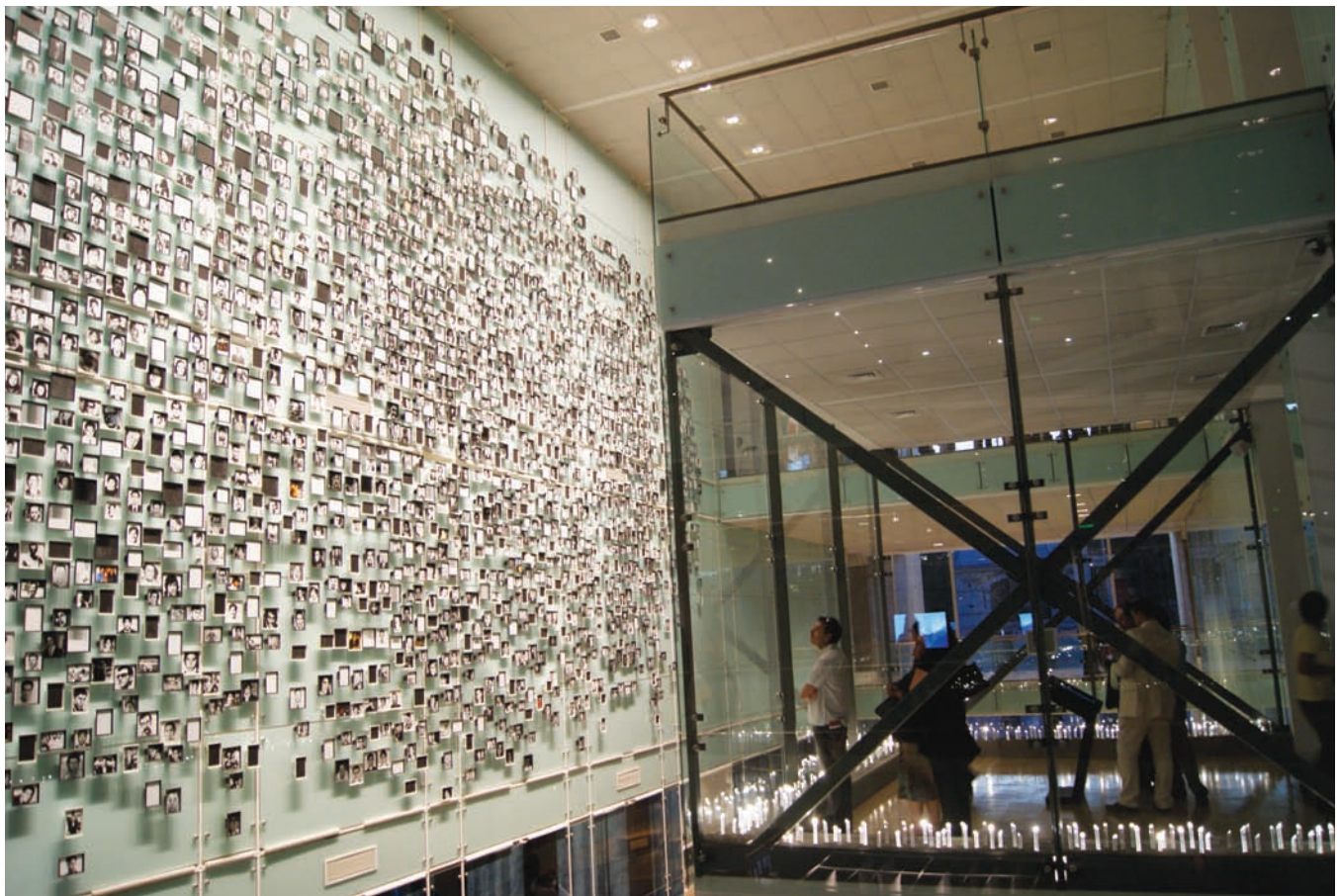
El Museo de la Memoria y los Derechos Humanos en Santiago de Chile.

sociedad que una vez las excluyó. Sin embargo, el objetivo es que los contenidos del Museo trasciendan las experiencias individuales para interpretar a todo el país y proyectarse hacia el porvenir.